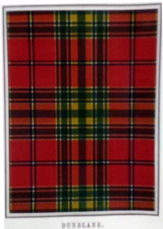
Plate 1. The Smiths' Dunblane plate.

The Smith Brothers were the first to show the design when they included it (Plate 1) in their 1850 publication 1 where they said of it: