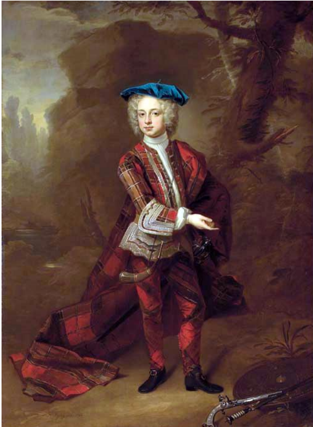
Plate 2. Thomas Osborne, 3 rd Viscount Dunblane by Hans Hausing, 1726

The portrait depicts a young man wearing a lace trimmed tartan jacket and trowsers with a large, apparently double with, plaid draped in stylised Roman toga fashion. Although the clothing is painted with some care the tartan is less so. Elements of the sett in the jacket and trowsers appear similar and look to be the same sett. The plaid too shows some of the same features although the sett seems to be bigger but this may just have been artistic licence; the artist is not renowned for painting Highland Dress. It was common for artists at the time use these props and it is not at all certain that the outfit would have been owned by Thomas Osborne. Irrespective of whether the outfit actually existed or whether the tartan was simply taken from a piece in artist's possession the detail of the tartan is not painted sufficiently well to allow an accurate extrapolation of the sett. The portrait was in the possession of the Duke of Leeds' family from commission until it was sold in 2005; the buyer and its current whereabouts are unknown.