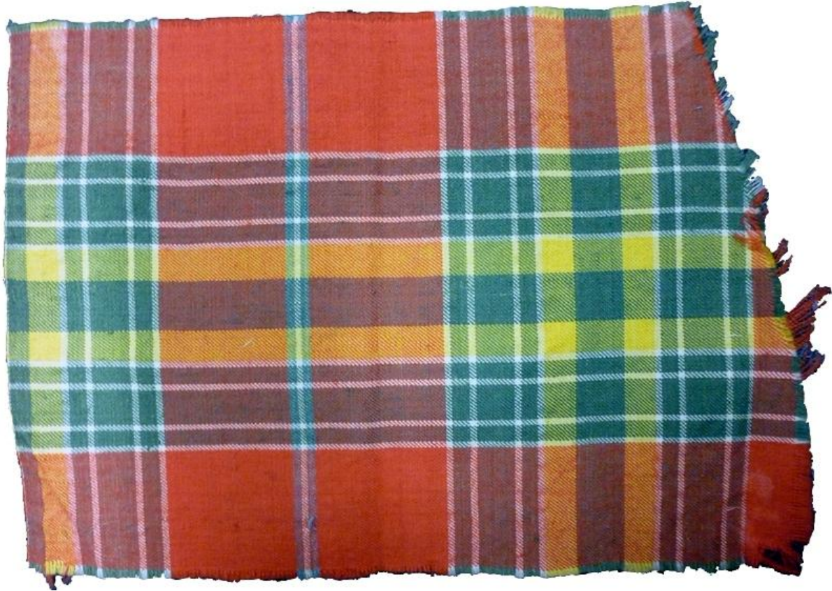
Plate 4. Wilsons' sample of Dunblane c.1820.

The Smiths' comment that the tartan ' ....has been copied and manufactured for His Grace ' at the time of the 1822 Levee places the design as one of those revived or invented during the Highland Revival many of which own their existence to the famous weaving firm of Wilsons of Bannockburn and this seems to be one of those. If the 5 th Duke did appear at the Levee in Highland Costume , then it would probably have been made earlier as there was little notice of the King's Jaunt and so insufficient time to have tartan woven and outfits made from scratch. The Scottish Tartans Authority has a small piece of unnamed Wilsons' material in this design which was probably the source of the Smiths' plate (Plate 4).