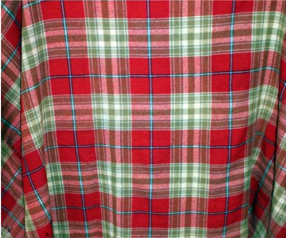
Plate 5. Dunblane plaid c.1860-80.

shade was not sought or not considered important. A collection of plaids sold in 2012 included a Dunblane one that followed the Wilsons' setting but with dark blue guard stripes showing that the change of shade was in commercial production within a few years of the Smiths' publication (Plate 5). How early this change occurred and whether it in fact happened earlier and the Smiths reproduced the then current version is unknown.