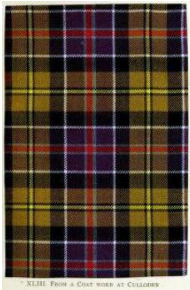
Plate 1. Coat worn at Culloden. Old & Rare, 1893

During a visit to the newly refurbished Kelvingrove Museum in Glasgow in 2007 the writer was astonished to see an item on display that was instantly recognisable as the Culloden Coat (Plate 2). The artefact had been identified by the National Museum of Scotland as a fine example of an 18 th Century tartan jacket some years ago but no-one had recognised the tartan and therefore made the connection with Stewart's design.