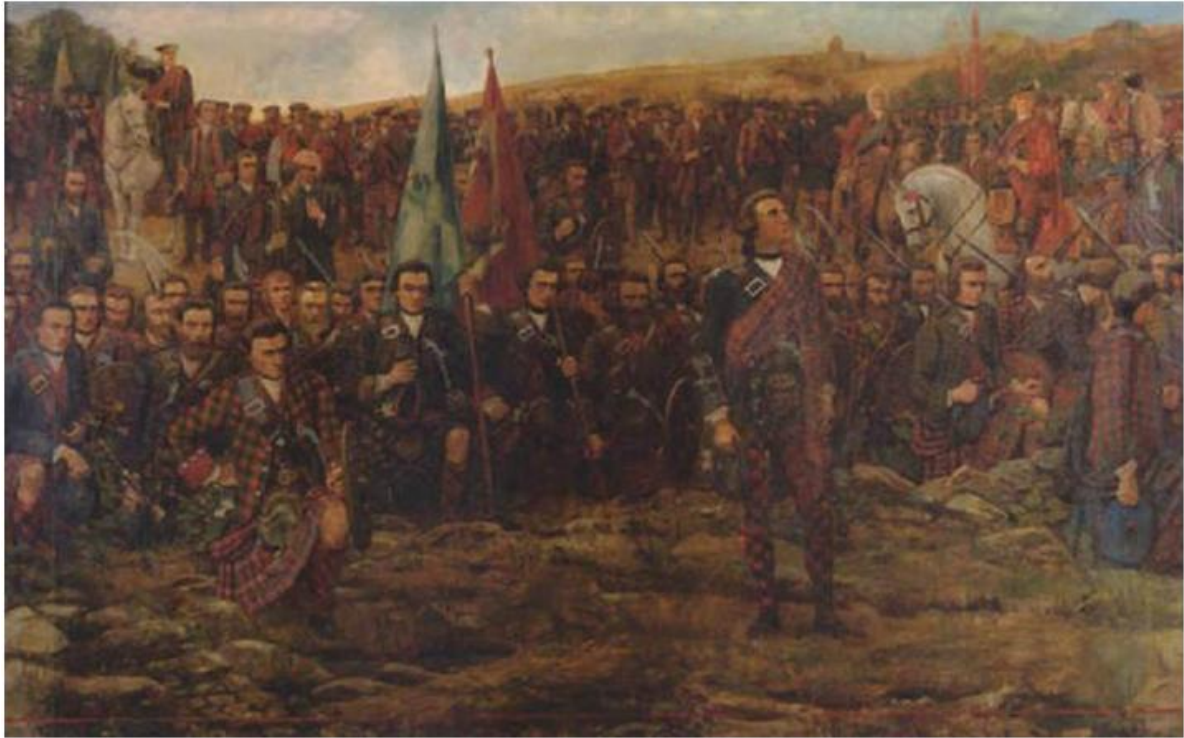
Plate 3. The prayer for victory, Battle of Prestonpans, 1745 Wm. Skeoch Cumming