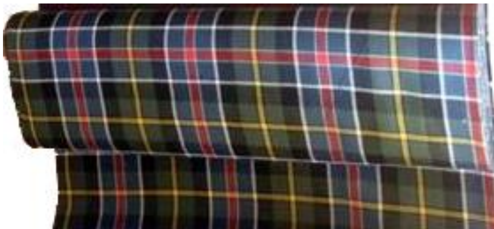
Plate 6. Reconstruction of the Culloden Coat tartan.

Following an examination of the coat the author organised the weaving of a length matched to the original setting and in colours closer to what the original coat might have looked like when new (Plate 6). This revision was later included as part of the House of Edgar's Genesis Collection (Plate 7).