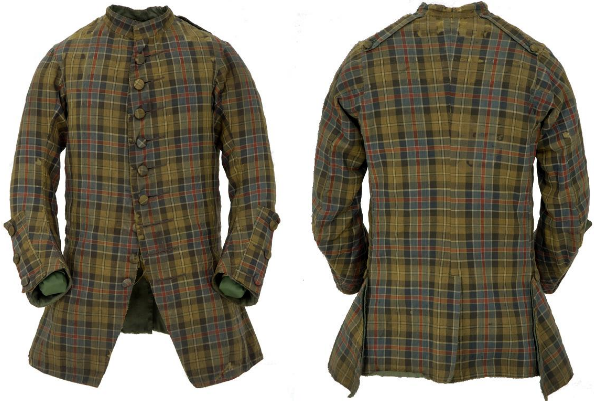
Plate 2. Culloden Coat.

Even though the colours and proportions of the original tartan differ markedly from those DWS depicted there is no doubt that it is the same coat. The colours were more like those that the author had suspected would have been the case. The original green is quite faded and very mossy, almost khaki but clearly nothing like the vivid gold colour that Stewart depicts, nor would it have been then. The style of the coat is typical of examples seen in portraits of the period. It would probably have been worn with trews and is cut for equestrian use.