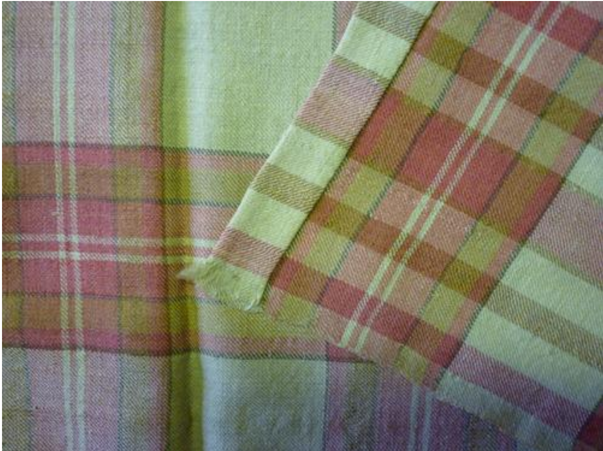
Plate 2. Detail of barred selvedge and turned end.