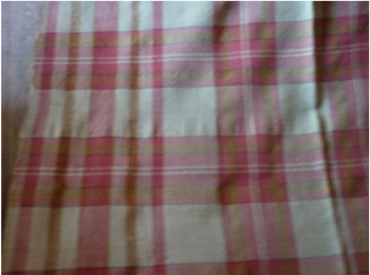
Plate 1. One side of the plaid showing the sett and barred border.

It's possible that the Blair plaid was damaged at some time as it has been cut up and sewn into a different shape with a fringe added, most probably during the Victorian era, but it's still possible to determine the detail of the original which was made from a length off-set cloth 21 1 / 2 " wide that was joined and finished with turned ends. Plate 1 shows the simple arisaid type sett together with the decorated barred selvedge. It's impossible to establish how long the plaid was as it has been cut in half widthways and one of the pieces then added to the remaining joined section to make a piece roughly 65" square. Material from the excess piece was then used to patch some holes and tears in the square and a fringe was added to one side. Fig 2 shows the detail of the barring and turned end.