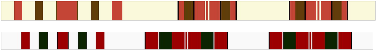
Fig 3. A comparison of the Blair and Wilsons' blanket pattern settings showing the sett and border.