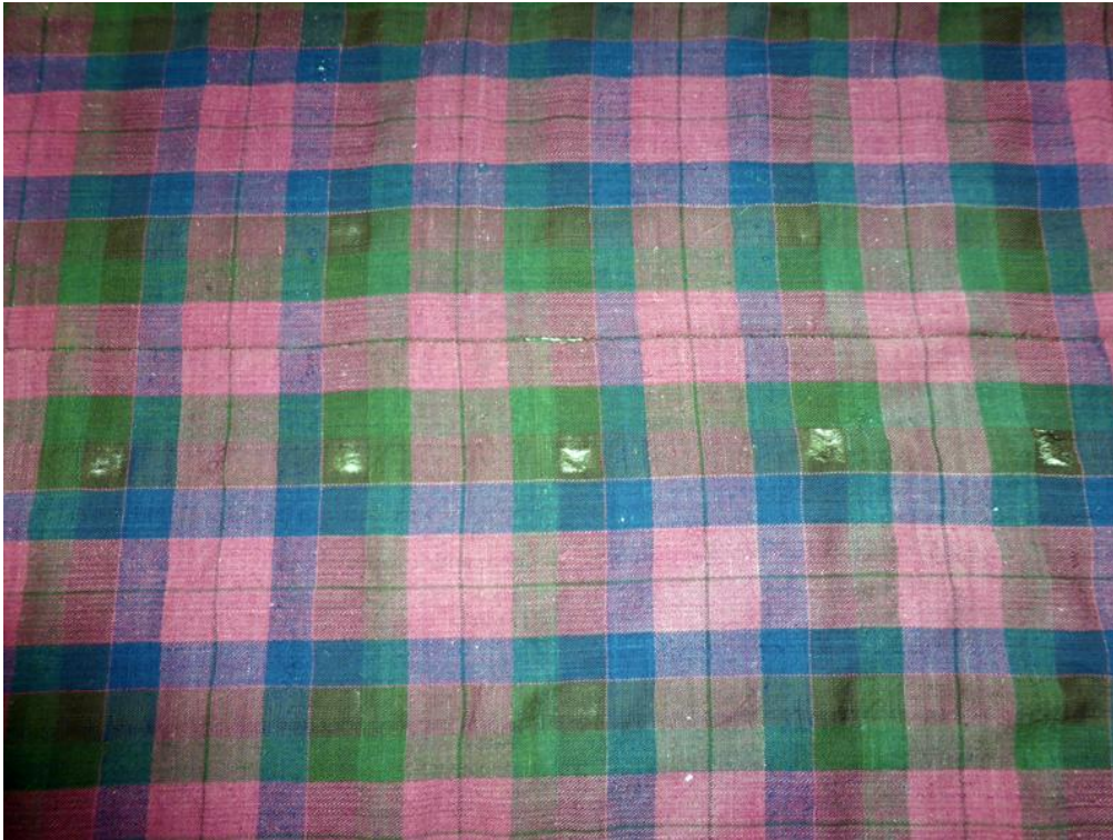
Plate 6. John Moir's Plaid showing the 'mark of a bullet hole'.

Whilst the idea of a bullet damaging the plaid in the heat of battle is a good story, the reason for the holes is probably far more straightforward and a result of the dyeing process. Iron 4 was commonly used as a mordant with a tannin dyestuff for black in 18 th rurally produced tartan. But whilst it was readily available, iron can cause the yarn to become brittle which over time causes it to deteriorate. The damage is obvious in this section where the black in the weft has completely disintegrated (Plate 7).