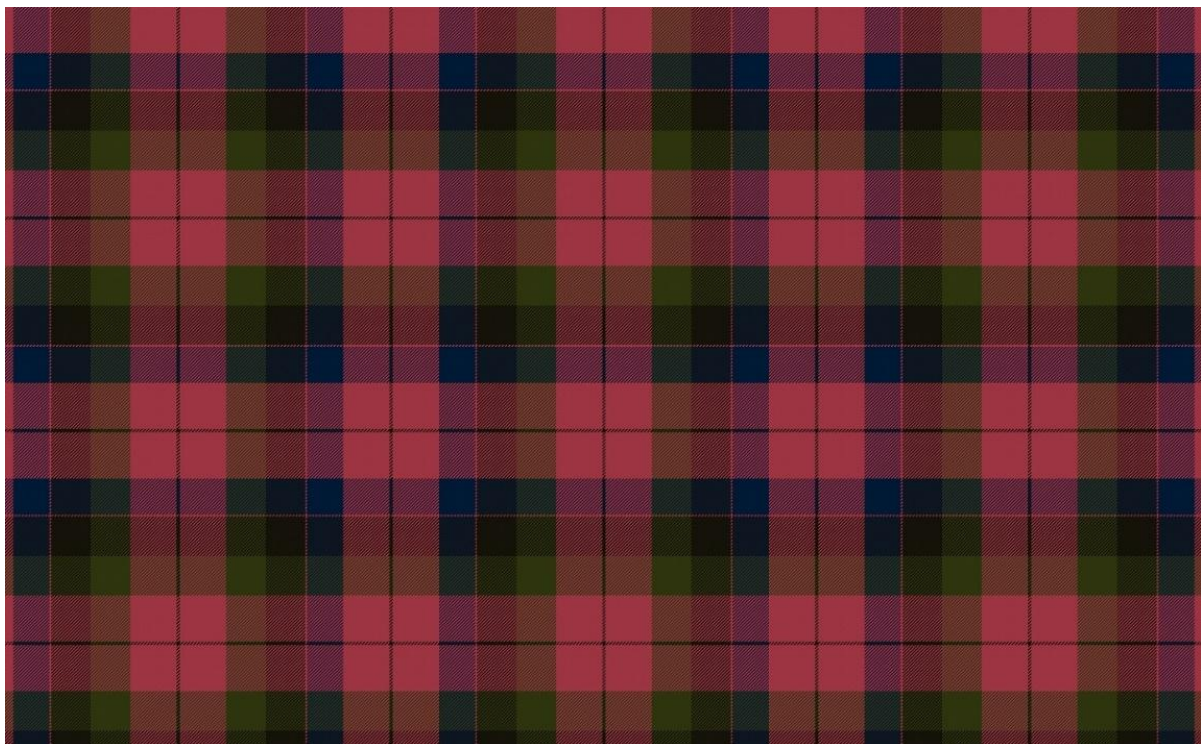
Plate 5. Graphic show the effect of two pieces of material being joined and the triple-stripe selvedge.

When two pieces of the warp are joined, the pattern repeats across the width of the cloth to give 4 half setts and a selvedge mark of each side which appears as three broad stripes. (Plate 5)