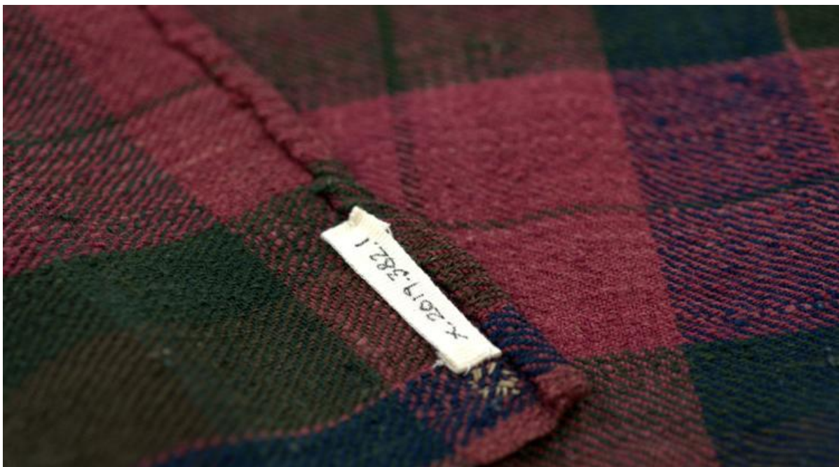
Plate 4. Detail showing one of the turned ends.