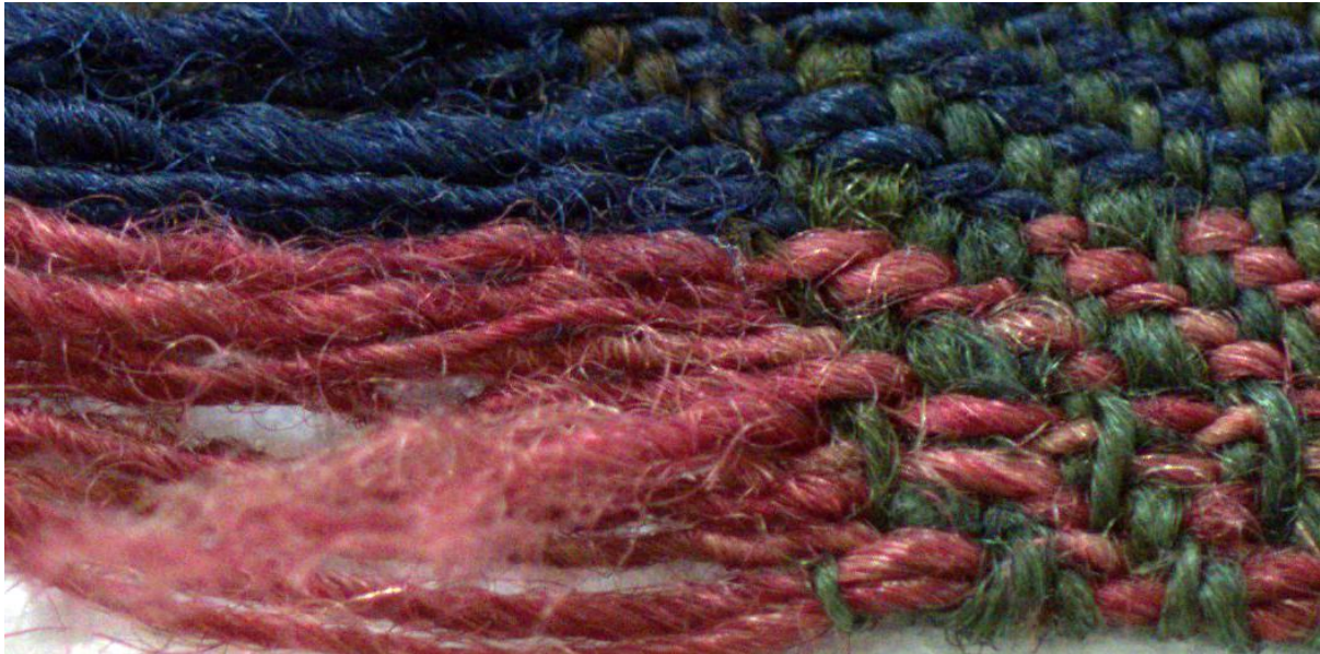
Plate 3. Detail showing the warp and weft singles.

No dye analysis has been conducted on the specimen but, if it were to be, it would probably confirm the use of: cochineal (red); indigo (blue); indigo + a yellow, native or imported (green); and probably a tannin source such as oak or alder for the black. The brownish shade of the latter points to little, or more likely no, indigo top-dyeing which was often done to get a darker shade. Testing of the yellow element of the green would help confirm the date as the presence of an imported hardwood would indicate a later 18 th century date.