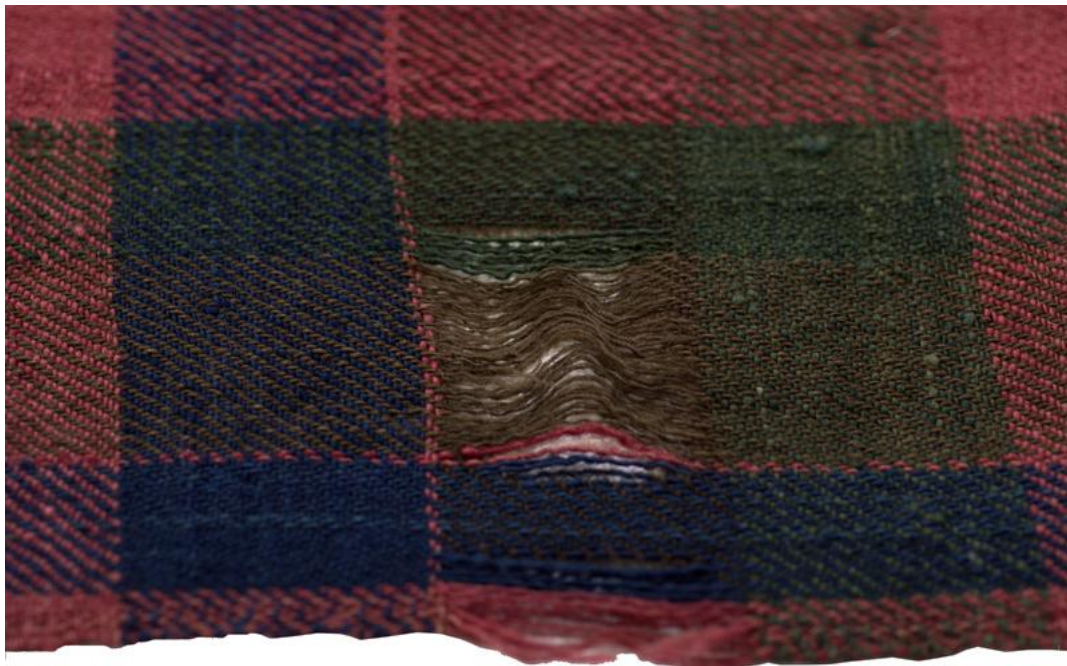
Plate 7. Disintegration of the black yarn in a section of the weft.

Whilst the idea of a bullet damaging the plaid in the heat of battle is a good story, the reason for the holes is probably far more straightforward and a result of the dyeing process. Iron 4 was commonly used as a mordant with a tannin dyestuff for black in 18 th rurally produced tartan. But whilst it was readily available, iron can cause the yarn to become brittle which over time causes it to deteriorate. The damage is obvious in this section where the black in the weft has completely disintegrated (Plate 7).