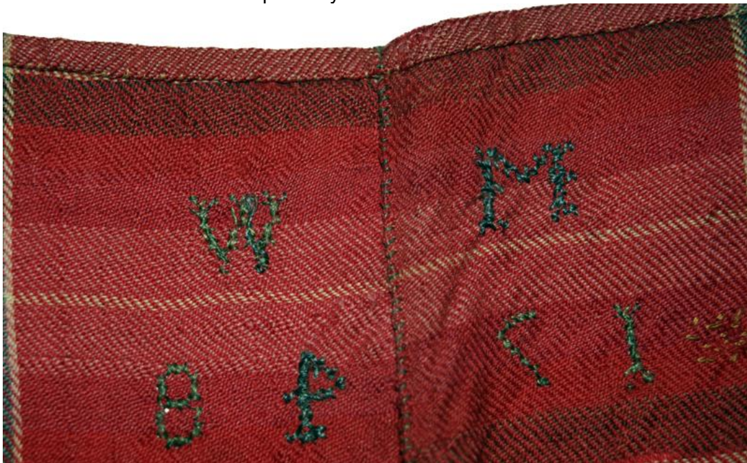
Plate 4. Overview of the join, initials turned end showing the different thread used.

The linen yarn used to join the two pieces and for embroidering the date and initials differs from that used turn the ends of the plaid (Plate 4). The presence of the joining thread in seam in the rolled ends confirms that the two halves were first joined and ends turned and sewn down afterwards. This turning was done with a paler thread that more closely matched the tartan shades and which was probably intended to be unobtrusive.