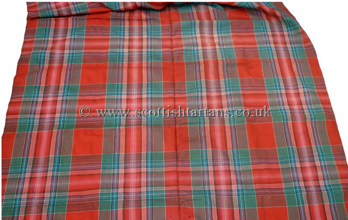
Plate 1. Joined plaid initialled and dated.

Throughout this paper, the term plaid 1 is used to describe this artefact; however, it is not suggested that this was a male belted plaid. The size, quality, lack of wear and the fact that it is initialled and dated are indicative of its use as a decorative piece, for example, as a bed cover.