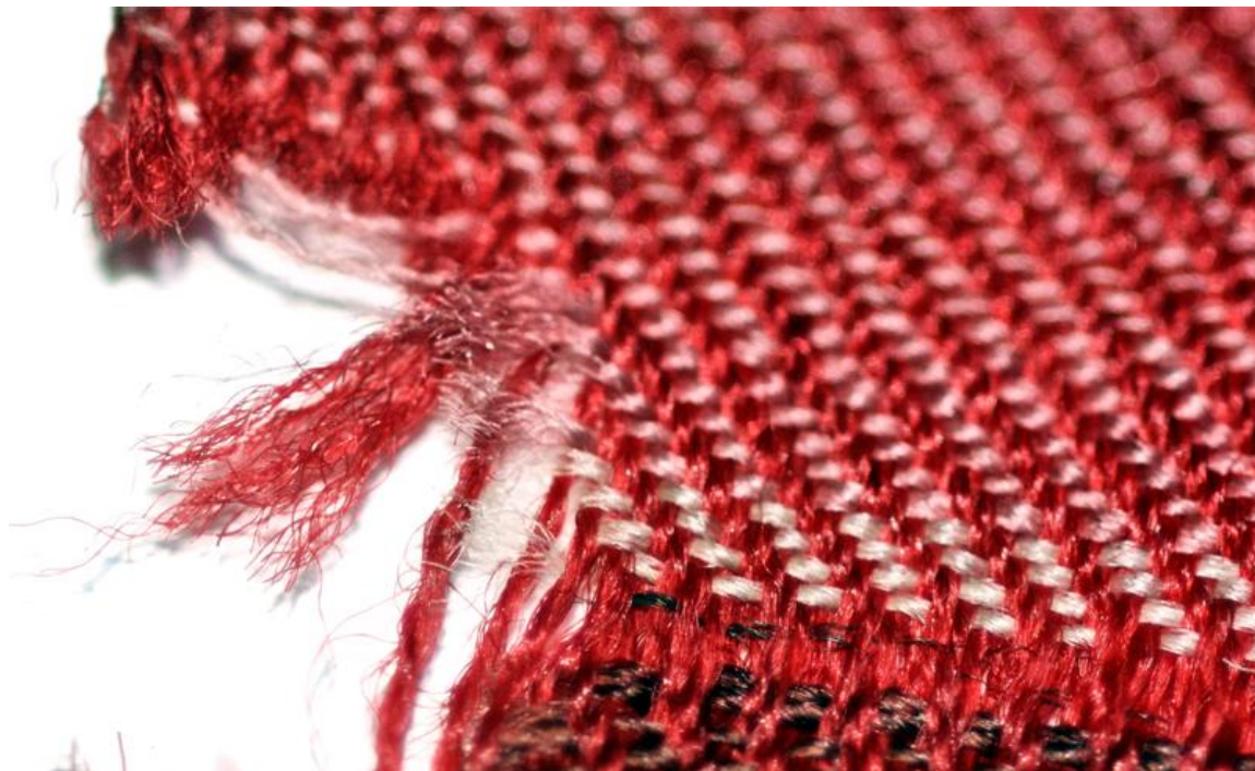
Plate 2. Detail of the warp and weft singles yarn.

The joined plaid measures 100 x 54 inches comprising two pieces of 27-inch-wide cloth joined selvedge to selvedge using a whip stitch and the rough (non-selvedge) ends turned and sewn down to prevent fraying. Woven at approximately 76 epi, the cloth has a balanced sett 3 with 4 half repeats across the of the warp giving 8 half setts (4 full repeats) across the width of the joined material. The yarn is single spun in both warp and weft and naturally dyed (Plate 2).