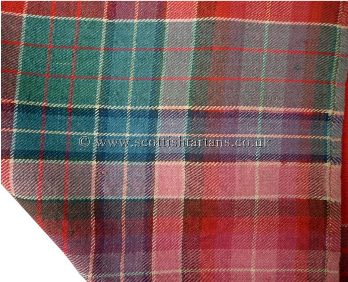
Plate 3. Detail of the 9 colours and shades in the plaid.

The linen yarn used to join the two pieces and for embroidering the date and initials differs from that used turn the ends of the plaid (Plate 4). The presence of the joining thread in seam in the rolled ends confirms that the two halves were first joined and ends turned and sewn down afterwards. This turning was done with a paler thread that more closely matched the tartan shades and which was probably intended to be unobtrusive.